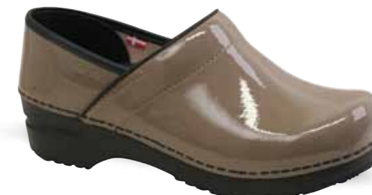
Professional Patent // 457406W // Patent leather 175 Taupe // Size 35-43