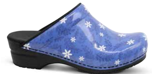
Isalena // 457618 // Printed PU leather 72 Light blue // Size 35-42