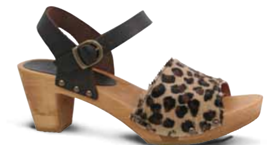
Camilla Flex // 470867 Cow fur and oil leather // 87 Leopard // Size 35-42