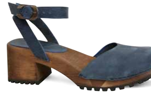
Sia Flex // 476270 Oil Leather // 35 Electric blue // Size 35-42