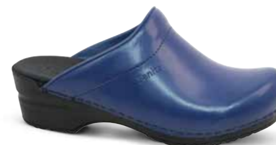
Sonja PU // 1500047 // PU Leather 55 Denim // Size 35-43