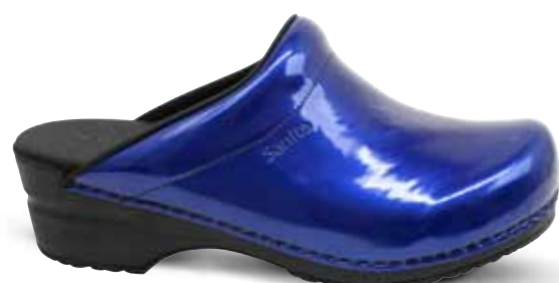
Metallic patent // 1990049 // Patent Leather 5 Blue // Size 35-43