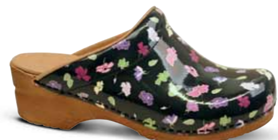
Illo // 477647 // Printed patent 2 Black // Size 35-42