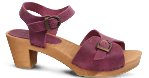
Tiana Flex // 470258 Oil Leather // 13 Pink // Size 35-42