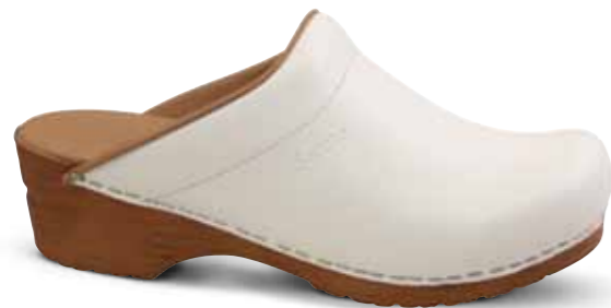
Sandra // 473047 // PU Leather 1 White // Size 35-42

Our wooden sole design turned into a soft comfortable PU (Polyurethane) sole with wood look. Extra comfortable with soft padded footbed cushioning the foot.