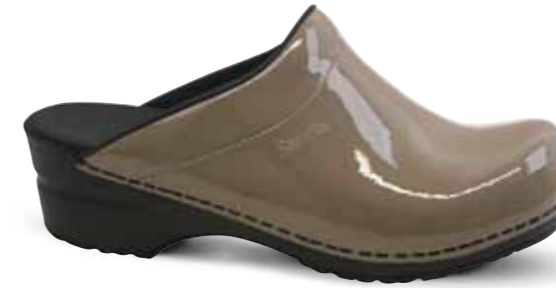
Sonja Patent // 450447 // Patent Leather 175 Taupe // Size 35-43