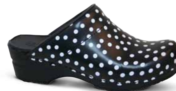
Fenja // 457048 // Printed PU Leather 2 Black // Size 35-42