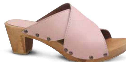
Ennike Flex // 472511 Soft Leather // 65 Pink // Size 35-42