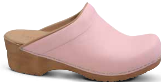
Sandra // 473047 // PU Leather 65 Pink // Size 35-42