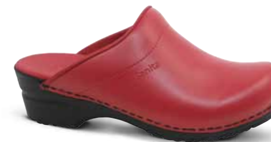
Sonja PU // 1500047 // PU Leather 4 Red // Size 35-43