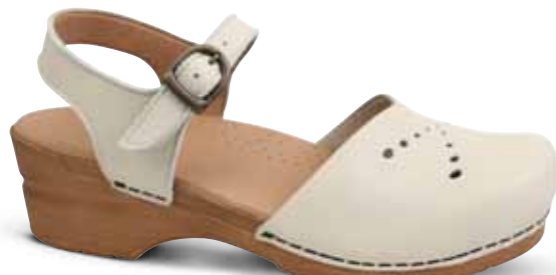
Sella // 474148 // leather 1 White // Size 35-42