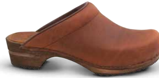
Chrissy // 1200009W // Oil Leather 3 Chestnut // Size 35-42 Christian // 1200009M // Oil Leather 3 Chestnut // Size 40-48