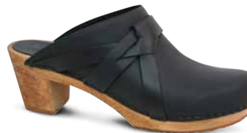
Manuella // 472200 Oil Leather // 2 Black // Size 35-42