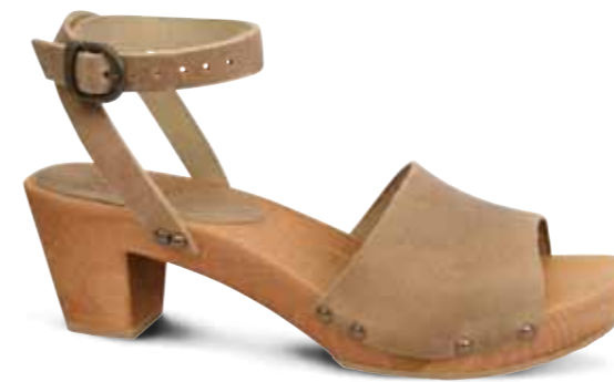
Yara Flex // 457357 Oil Leather // 14 Nature // Size 35-42