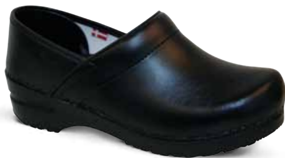
Original-Prof. PU // 1500006W PU Leather // 2 Black // Size 35-43