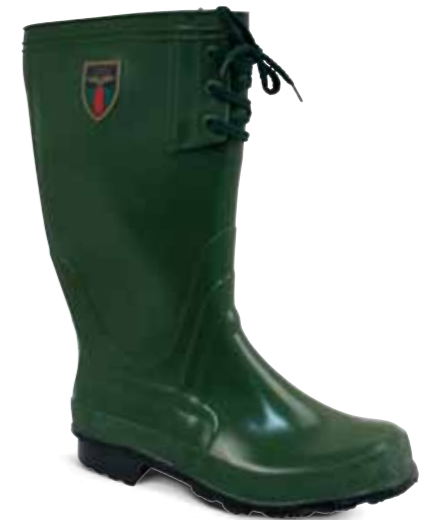
Hunting Boot // 538665 // PVC Rubber 25 Green // Size 34-46