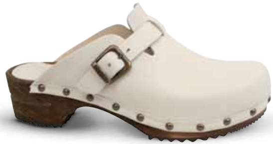
Kristel // 455205W // Leather 1 White // Size 35-42