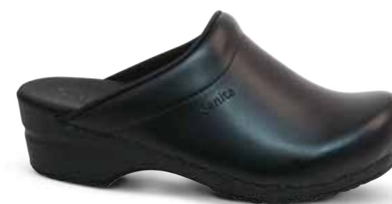
Sonja PU // 1500047 // PU Leather 2 Black // Size 35-43