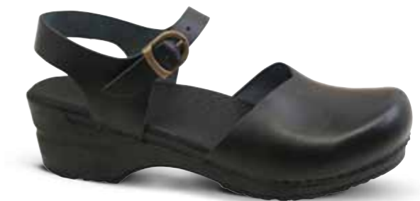
Sansi // 474048 // PU Leather 2 Black // Size 35-42