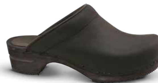
Chrissy // 1200009W // Oil Leather 2 Black // Size 35-42 Christian // 1200009M // Oil Leather 2 Black // Size 40-48