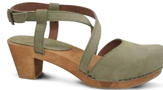
Linja Flex // 474107 Suede // 43 Green // Size 35-42

Cow suede from Italian tanneries; a soft velvet touch. Selected colour palette for clogs and sandals.