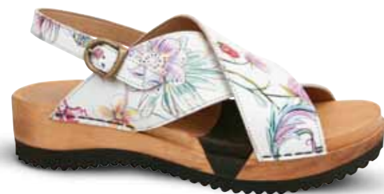
Tiska Flex // 474623 Printed leather // 1 White // Size 35-42

Sling back style, slides and strappy sandals in soft leather; printed or solid colours. Light weight flexible wooden outsoles in various heel heights.