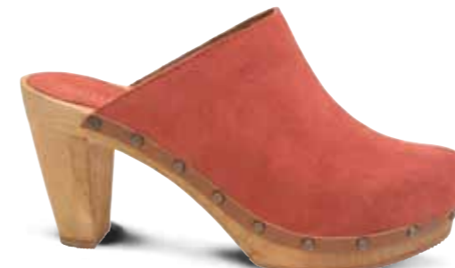
Elisa // 476100 Suede // 9 Orange // Size 35-42