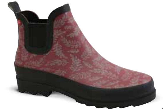
Felicia Welly // 467987 // Natural Rubber 47 Bordeaux // Size 36-42