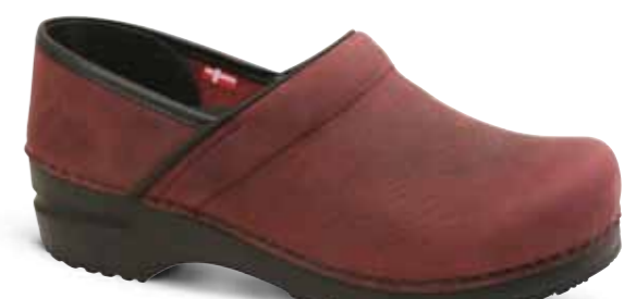
Original-Prof. Textured Oil // 450206W // WR Oil Leather 60 Bordeaux // Size 35-43