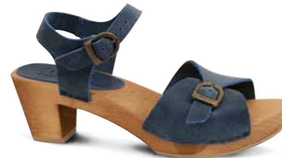
Tiana Flex // 470258 Oil Leather // 35 Electric blue // Size 35-42