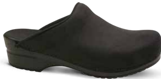
Sonja Textured Oil // 450247 // WR Oil Leather 2 Black // Size 35-43 Karl Textured Oil // 450250 // WR Oil Leather 2 Black // Size 40-48

Sanita Oil nubuck is thick cow leather with a buffed and oiled surface. The oil treatment creates a natural and mat look and highlight the dept in the colours. The leather has the characteristic cow grain structure and is treated to be water resistant.