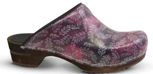
Flok // 472029 // Printed PU Leather 47 Bordeaux // Size 35-42