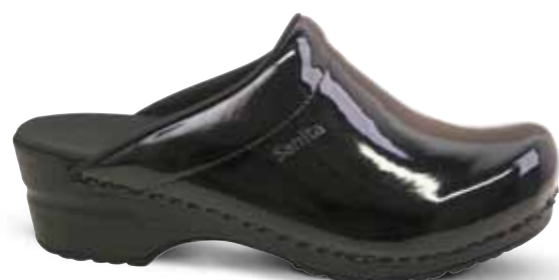
Metallic patent // 1990049 // Patent Leather 2 Black // Size 35-43