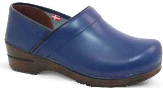
Izabella // 457006W // PU Leather 5 Blue // Size 35-43