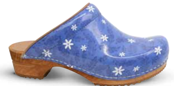
Flok // 472029 // Printed PU Leather 72 Light blue // Size 35-42