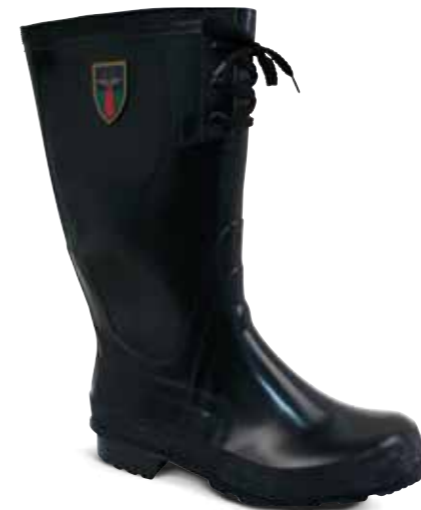
Hunting Boot // 538665 // PVC Rubber 2 Black // Size 34-46