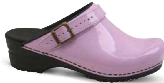
Freya // 457548 // Patent Leather 81 Purple // Size 35-42