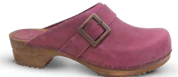
Urban // 453062 // Oil Leather 13 Pink // Size 35-42