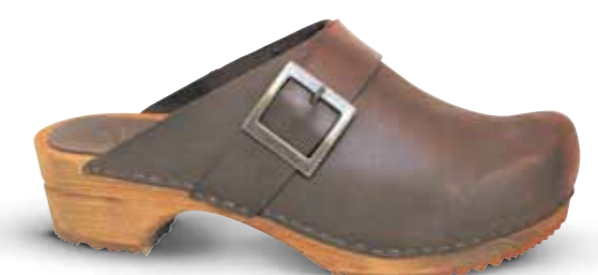
Urban // 453062 // Oil Leather 78 Ant. Brown // Size 35-42