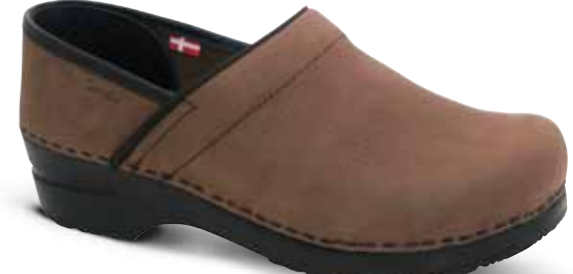
Original-Prof. Textured Oil // 450206W // WR Oil Leather 78 Ant. Brown // Size 35-43 Original-Prof. Textured Oil // 450206M // WR Oil Leather 78 Ant. Brown // Size 40-48