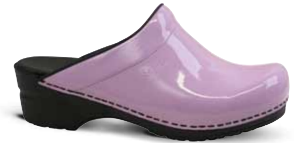
Sonja Patent // 450447 // Patent Leather 32 Purple // Size 35-43