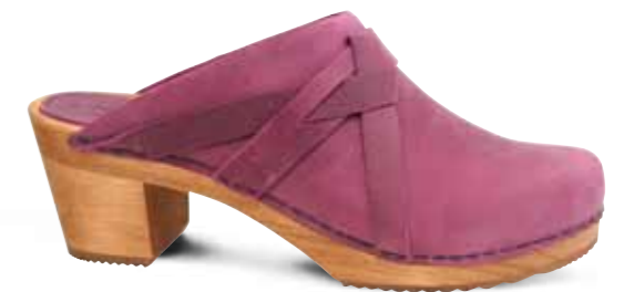
Manuella // 472200 Oil Leather // 13 Pink // Size 35-42