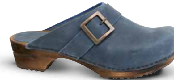
Urban // 453062 // Oil Leather 35 Electric blue // Size 35-42