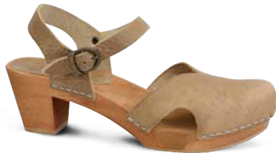
Matrix Flex // 451207 Oil Leather // 14 Nature // Size 35-42