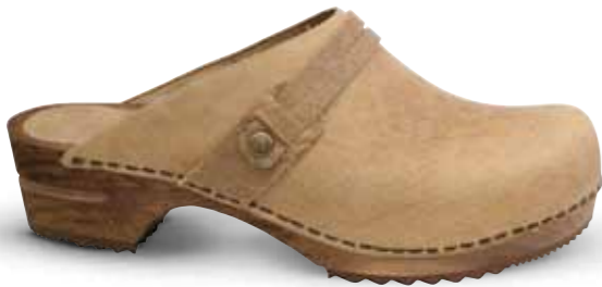
Ursana // 474260 // WR Oil Leather // 14 Nature // Size 35-42