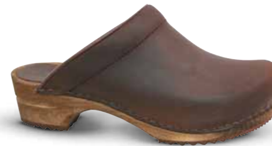
Chrissy // 1200009W // Oil Leather 78 Ant. Brown // Size 35-42 Christian // 1200009M // Oil Leather 78 Ant. Brown // Size 40-48