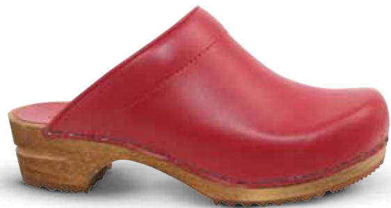
Lotte // 470009W // PU Leather 4 Red // Size 35-42

Natural wooden soles and cleanable materials. PU coated split leather which is perfectly moulded to the clog last will maintain the shape - easy to clean!