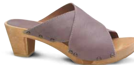
Ennike Flex // 472511 Soft leather // 32 Purple // Size 35-42