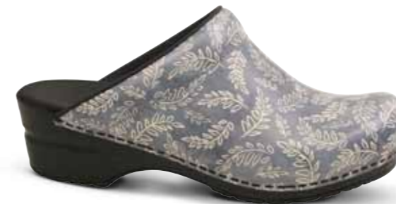
Isalena // 457618 // Printed PU leather 20 Grey // Size 35-42