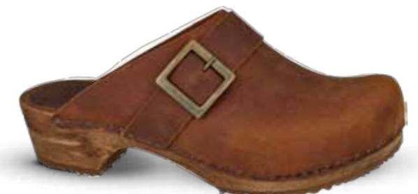
Urban // 453062 // Oil Leather 3 Chestnut // Size 35-42