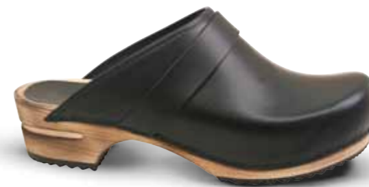
Rikke // 476009 // PU Leather 2 Black // Size 35-42

Traditional clog style with special finish of the lime tree sole. Cleanable PU coated split leather.