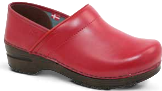
Izabella // 457006W // PU Leather 4 Red // Size 35-43