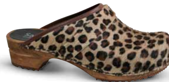
Caroline // 1706199W // Cow Fur 87 Leopard // Size 35-42

Natural wooden soles and cleanable materials. Coated split leather with high glossy patent finish - easy to clean!