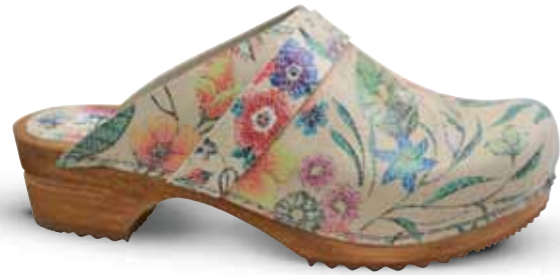
Vegu // 476909 Micro fibre // 24 Beige // Size 35-42

Our Sanita VEGAN styles are Eco-friendly and with no trace of animal products. Flower printed micro fibre material on a classic clog and slide sandal with flexible wooden outsole.