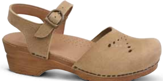
Sella // 474148 // Oil Nubuck 14 Nature // Size 35-42