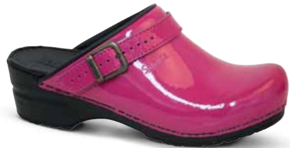
Freya // 457548 // Patent Leather 79 Fuchsia // Size 35-42