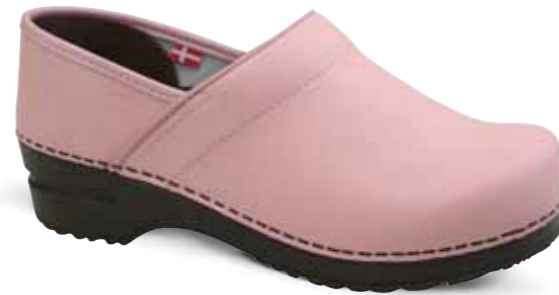
Izabella // 457006W // PU Leather 65 Pink // Size 35-43