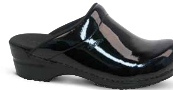
Sonja Patent // 450447 // Patent Leather 2 Black // Size 35-43