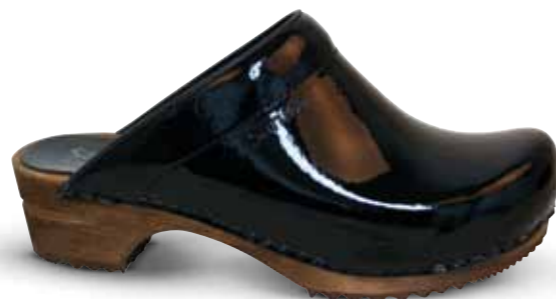
Classic Patent // 457012 // Patent Leather 2 Black // Size 35-42