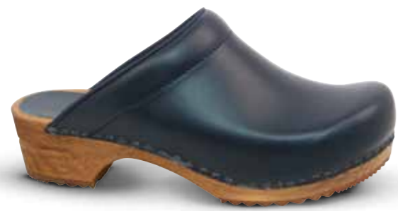
Lotte // 470009W // PU Leather 5 Blue // Size 35-42