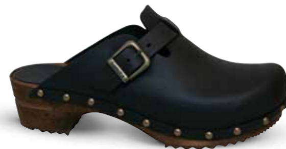
Kristel // 455205W // Oil Leather 2 Black // Size 35-42