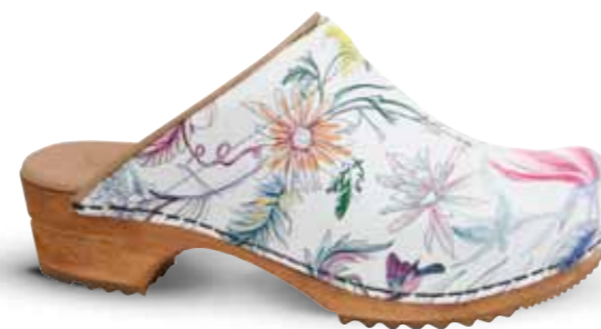
Orchid // 474609 // Printed Leather 1 White // Size 35-42