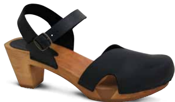
Matrix Flex // 451207 Oil Leather // 2 Black // Size 35-42