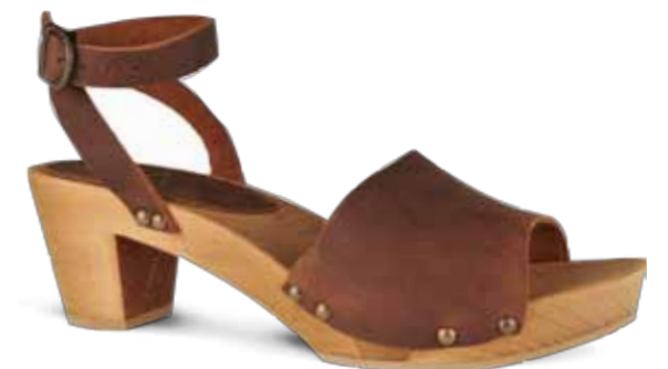
Yara Flex // 457357 Oil Leather // 3 Chestnut // Size 35-42