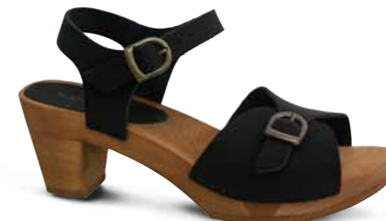
Tiana Flex // 470258 Oil Leather // 2 Black // Size 35-42