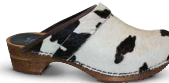
Caroline // 1706199W // Cow Fur 3 Brown Cow // Size 35-42 Casper // 1706199M // Cow Fur 3 Brown Cow // Size 40-48