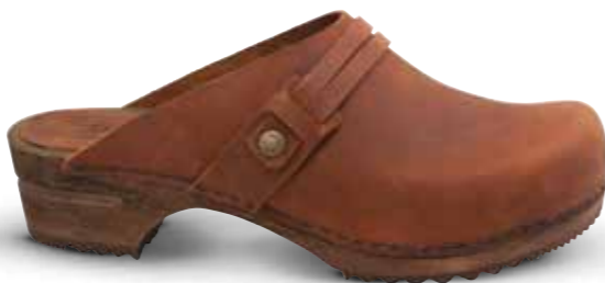
Ursana // 474260 // WR Oil Leather // 3 Chestnut // Size 35-42