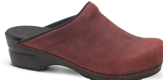
Sonja Textured Oil // 450247 // WR Oil Leather 60 Bordeaux // Size 35-43