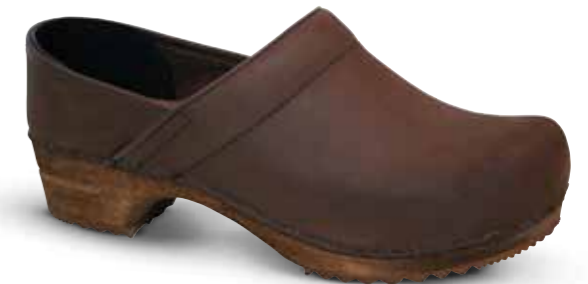
Julie // 1201005W // Oil Leather 78 Ant. Brown // Size 35-42 Jamie // 1201005M // Oil Leather 78 Ant. Brown // Size 40-48