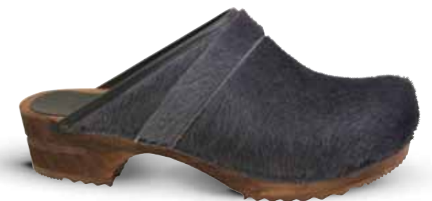
Caroline // 1706199W // Cow Fur 56 Steel // Size 35-42 Casper // 1706199M // Cow Fur 56 Steel // Size 40-48