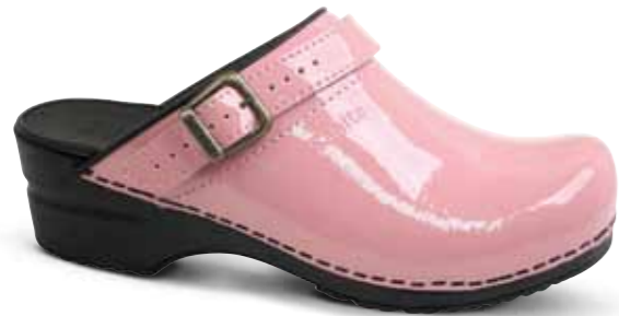
Freya // 457548 // Patent Leather 65 Rose // Size 35-42

Patent coated leather is split leather (suede) with shiny lacquered Polyurethane foil covering the surface. A strong and water proof leather – easy to clean.