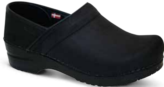
Original-Prof. Textured Oil // 450206W // WR Oil Leather 2 Black // Size 35-43 Original-Prof. Textured Oil // 450206M // WR Oil Leather 2 Black // Size 40-48