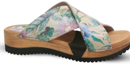
Velo Flex // 476923 Micro fibre // 24 Beige // Size 35-42