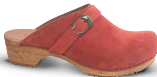
Hedi // 457190 // Suede 9 Orange // Size 35-42