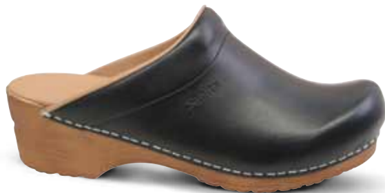
Sandra // 473047 // PU leather 2 Black // Size 35-42