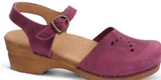
Sella // 474148 // Oil Nubuck 13 Pink // Size 35-42