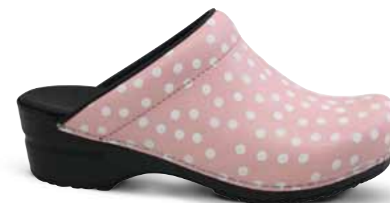
Fenja // 457048 // Printed PU Leather 65 Rose // Size 35-42