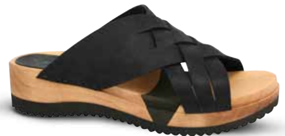
Salto Flex // 476220 Oil Leather // 2 Black // Size 35-42