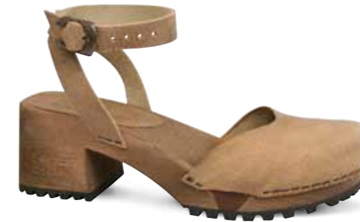
Sia Flex // 476270 Oil Leather // 14 Nature // Size 35-42

Unlined oiled nubuck sandals; adjustable ankle strap on flexible and non flexible wooden sole