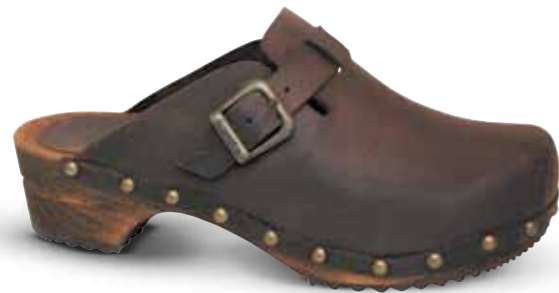
Kristel // 455205W // Oil Leather 78 Ant. Brown // Size 35-42