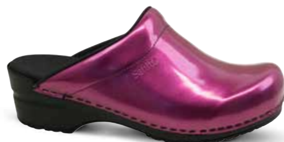
Metallic patent // 1990049 // Patent Leather 32 Purple // Size 35-43