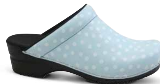
Fenja // 457048 // Printed PU Leather 72 Sky // Size 35-42