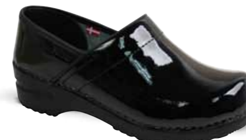
Professional Patent // 457406W // Patent leather 2 Black // Size 35-43