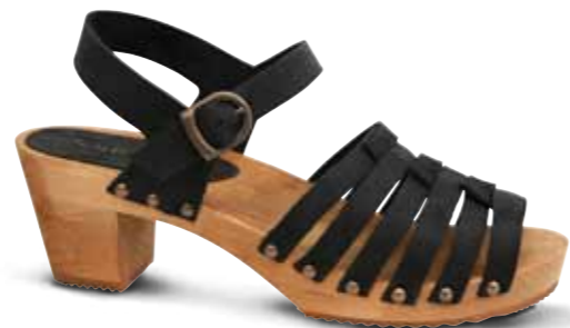
Silo // 476204 Oil Leather // 2 Black // Size 35-42