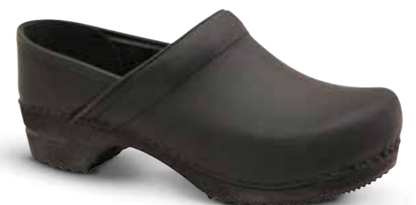
Julie // 1201005W // Oil Leather 2 Black // Size 35-42 Jamie // 1201005M // Oil Leather 2 Black // Size 40-48