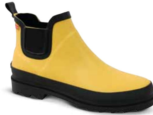
Felicia Welly // 467987 // Natural Rubber 7 Yellow // Size 36-42

Danish design, classical Scandinavian look and feel in our range of wellies Our Chelsea boot is made of NATURAL rubber which is MAX flexible and durable. At rainy days Sanita wellies will keep your feet dry and warm.