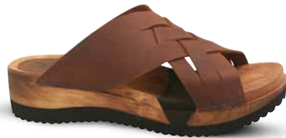
Salto Flex // 476220 Oil Leather // 3 Chestnut // Size 35-42