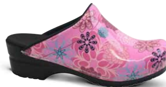
Inalo // 475647 // Printed patent leather 79 Fuchsia // Size 35-42