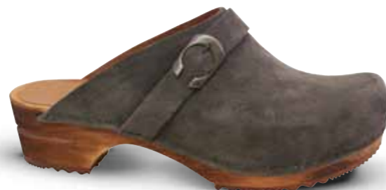
Hedi // 457190 // Suede 69 Grey // Size 35-42