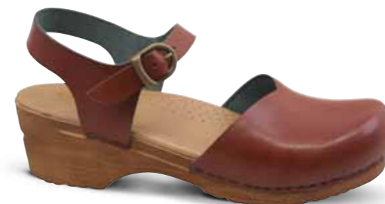
Sansi // 474048 // PU Leather 3 Brown // Size 35-42