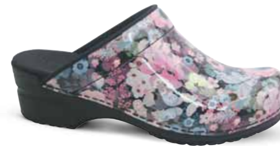
Isalena // 457618 // Printed Patent 65 Rose // Size 35-42