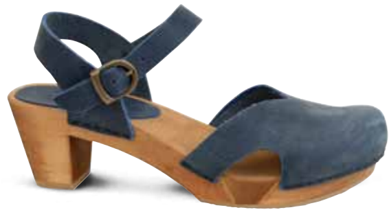
Matrix Flex // 451207 Oil Leather // 35 Electric blue // Size 35-42