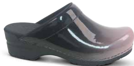
Original // 1990045 // Patent Leather 65 Rose // Size 35-43