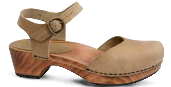
Sita // 476271 Oil Leather // 14 Nature // Size 35-42