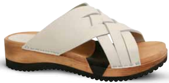
Salto Flex // 476220 Leather // 1 White // Size 35-42