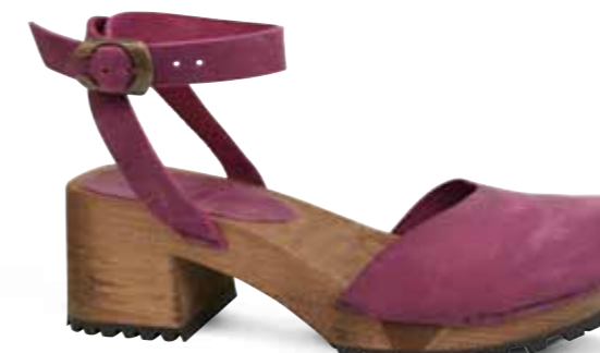
Sia Flex // 476270 Oil Leather // 13 Pink // Size 35-42