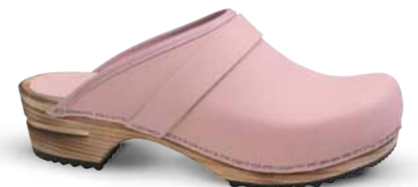
Rikke // 476009 // PU Leather 65 Pink // Size 35-42