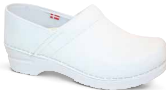
Original-Prof. PU // 1500006W PU Leather // 1 White // Size 35-43