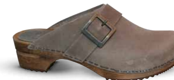
Urban // 453062 // Oil Leather 20 Grey // Size 35-42