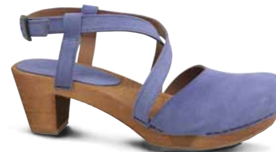
Linja Flex // 474107 Suede // 85 Purple // Size 35-42