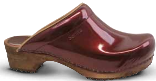
Classic Patent // 457012 // Metallic Patent 47 Bordeaux // Size 35-42