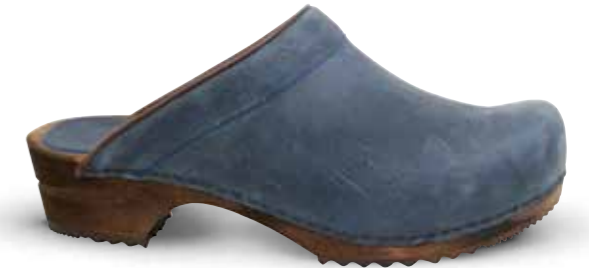
Chrissy // 1200009W // Oil Leather 35 Electric blue // Size 35-42