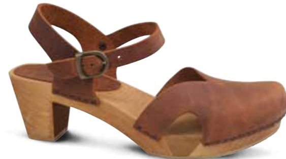
Matrix Flex // 451207 Oil Leather // 3 Chestnut // Size 35-42