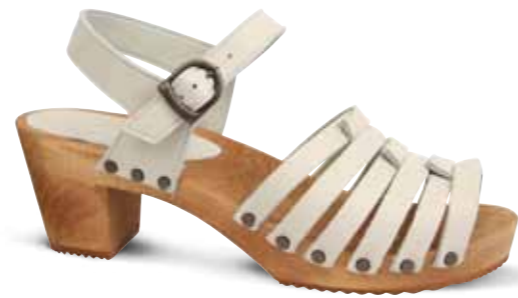
Silo // 476204 Leather // 1 White // Size 35-42