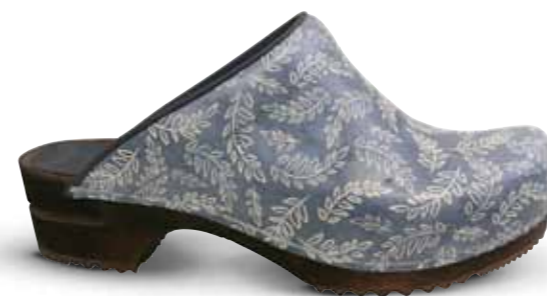
Flok // 472029 // Printed PU Leather 20 Grey // Size 35-42

Flower printed soft leather or printed PU coated leather on the Sanita classic wooden outsole. Soft padded instep or comfort footbed.