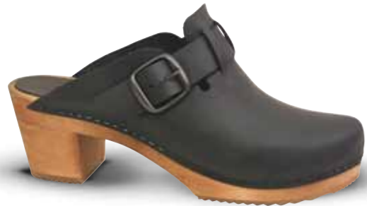
Malulo // 476200 Oil Leather // 2 Black // Size 35-42

The Sanita DNA: Handcrafted Original Danish Clogs since 1907 – more than 110 years of experience in clog making. Comfort and quality are keywords for this wide range of wooden clogs made in a selection of genuine leathers; oiled, patent or printed variation.