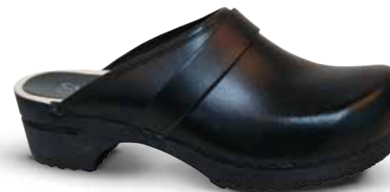
Rita // 1500199W // PU Leather 2 Black // Size 35-42