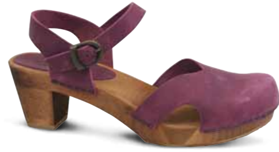
Matrix Flex // 451207 Oil Leather // 13 Pink // Size 35-42