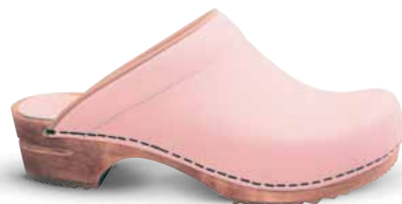
Lotte // 470009W // PU Leather 65 Pink // Size 35-42