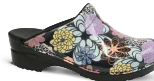
Inalo // 475647 // Printed patent leather 2 Black // Size 35-42