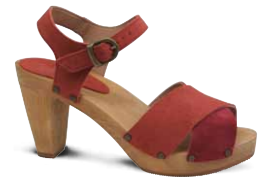
Elia // 476101 Suede // 9 Orange // Size 35-42