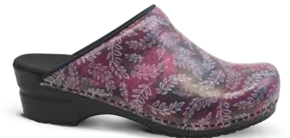
Isalena // 457618 // Printed PU leather 47 Bordeaux // Size 35-42