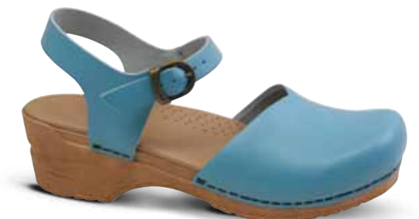
Sansi // 474048 // PU Leather 19 Teal // Size 35-42