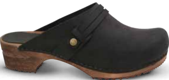
Ursana // 474260 // WR Oil Leather // 2 Black // Size 35-42