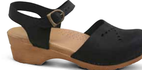
Sella // 474148 // Oil Nubuck 2 Black // Size 35-42