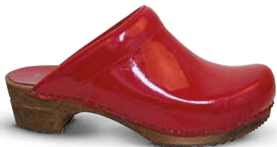
Classic Patent // 457012 // Patent Leather 4 Red // Size 35-42

Traditional clogs in cow fur with various prints. Leather lined genuine cow leather; without removal of natural cow hairs covering the surface.