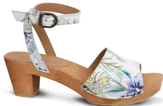
Otium Flex // 474619 Printed Leather // 1 White // Size 35-42