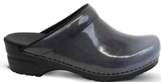
Original // 1990045 // Patent Leather 16 Silver // Size 35-43