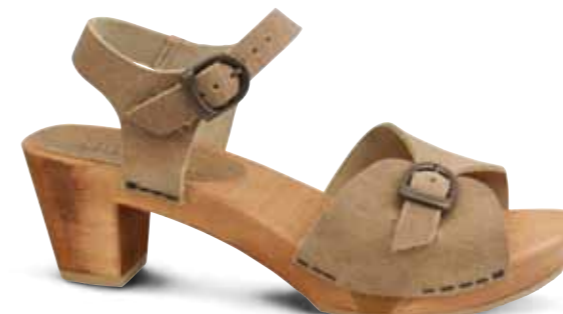
Tiana Flex // 470258 Oil Leather // 14 Nature // Size 35-42