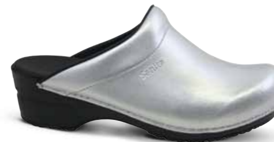
Sonja PU // 1500047 // PU Leather 16 Silver // Size 35-43

PU coated leather is split leather (suede) with a Polyurethane foil covering the surface The mat PU foil is strong and durable and makes the clog suitable for work. The surface of the leather can easily be cleaned; even with disinfecting liquid.