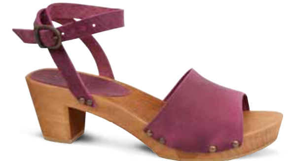
Yara Flex // 457357 Oil Leather // 13 Pink // Size 35-42