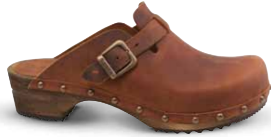
Kristel // 455205W // Oil Leather 3 Chestnut // Size 35-42