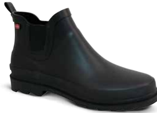
Felicia Welly // 467987 // Natural Rubber 2 Black // Size 36-42