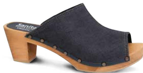
Vita Flex // 476910 Recycled Denim // 29 Navy // Size 35-42