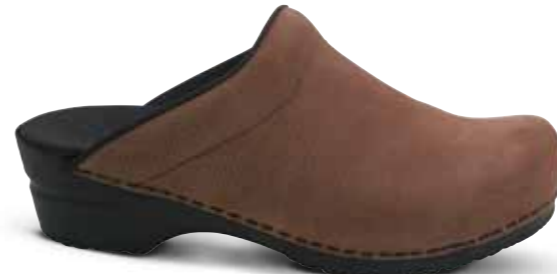
Sonja Textured Oil // 450247 // WR Oil Leather 78 Ant. Brown // Size 35-43 Karl Textured Oil // 450250 // WR Oil Leather 78 Ant. Brown // Size 40-48