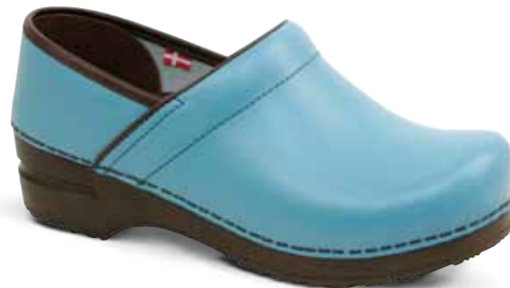
Izabella // 457006W // PU Leather 19 Teal // Size 35-43