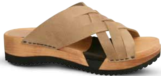
Salto Flex // 476220 Oil Leather // 14 Nature // Size 35-42