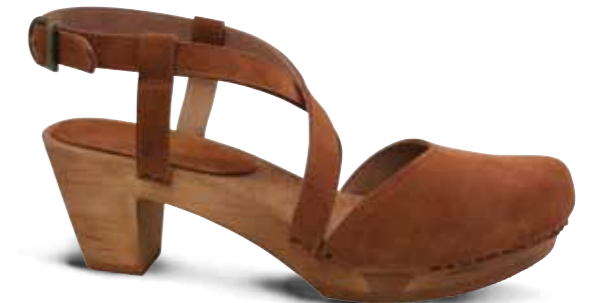
Linja Flex // 474107 Suede // 15 Cognac // Size 35-42