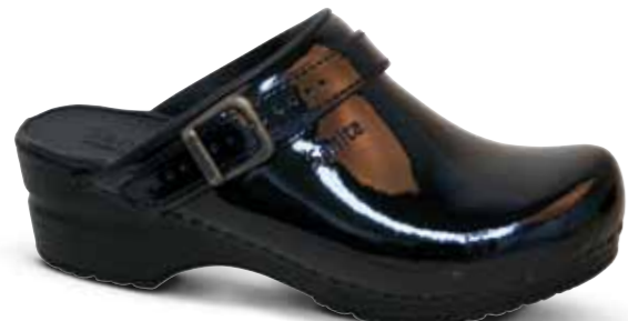
Freya // 457548 // Patent Leather 2 Black // Size 35-42