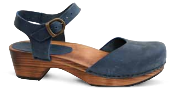
Sita // 476271 Oil Leather // 35 Electric blue // Size 35-42