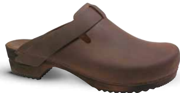
Karsten // 476505 // Oil Leather 78 Antique brown // Size 40-48