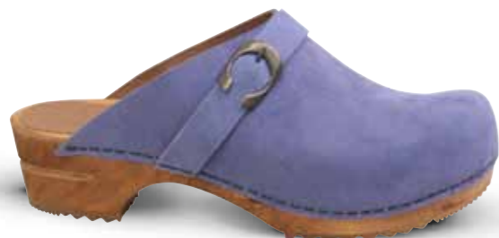
Hedi // 457190 // Suede 85 Purple // Size 35-42