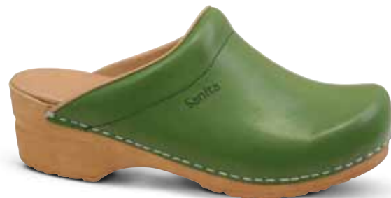
Sandra // 473047 // PU Leather 25 Green // Size 35-42