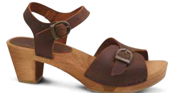
Tiana Flex // 470258 Oil Leather // 3 Chestnut // Size 35-42