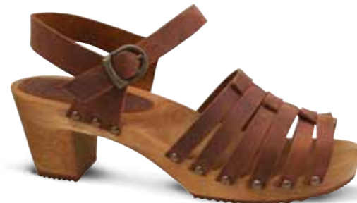
Silo // 476204 Oil Leather // 3 Chestnut // Size 35-42