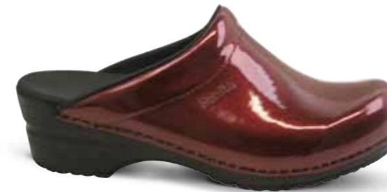
Sonja Patent // 450447 // Patent Leather 47 Bordeaux // Size 35-43