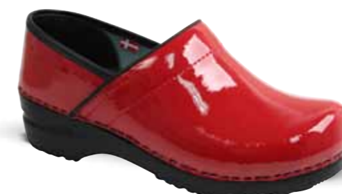
Professional Patent // 457406W // Patent leather 4 Red // Size 35-43