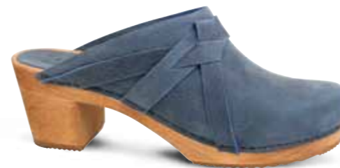
Manuella // 472200 Oil Leather // 35 Electric blue // Size 35-42