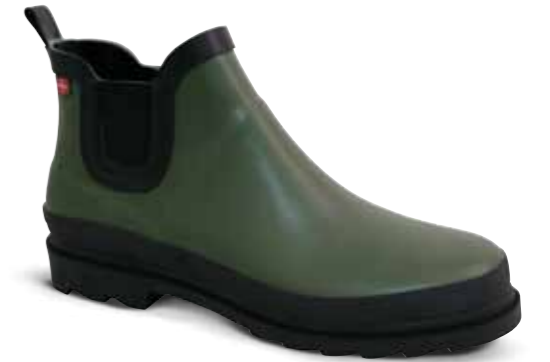
Felicia Welly // 467987 // Natural Rubber 64 Olive // Size 36-42