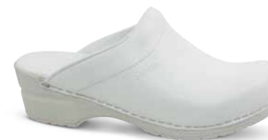
Sonja PU // 1500047 // PU Leather 1 White // Size 35-43