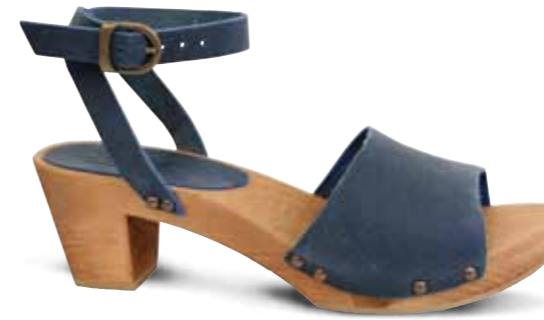
Yara Flex // 457357 Oil Leather // 35 Electric blue // Size 35-42