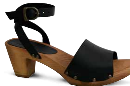
Yara Flex // 457357 Oil Leather // 2 Black // Size 35-42