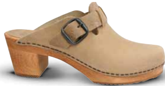
Malulo // 476200 Oil Leather // 14 Nature // Size 35-42