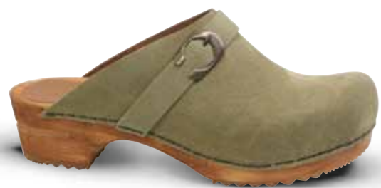
Hedi // 457190 // Suede 43 Green // Size 35-42

Traditional clog style in SUEDE; selected colours matching the Spring/Summer 2022 palette. 5 cm high platform sole with heel carving; the iconic Sanita wood style.