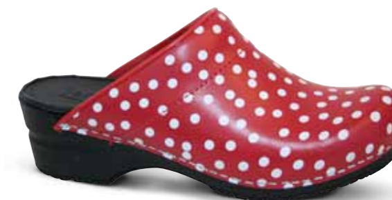
Fenja // 457048 // Printed PU Leather 4 Red // Size 35-42