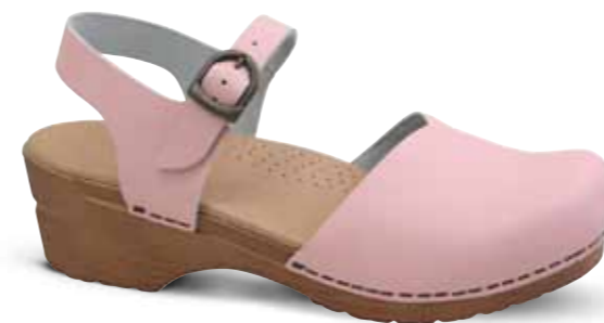
Sansi // 474048 // PU Leather 65 Pink // Size 35-42