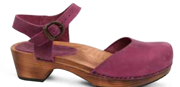
Sita // 476271 Oil Leather // 13 Pink // Size 35-42