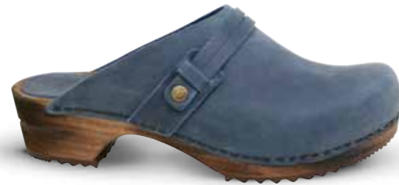
Ursana // 474260 // WR Oil Leather // 35 Electric blue // Size 35-42