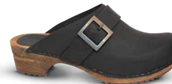
Urban // 453062 // Oil Leather 2 Black // Size 35-42