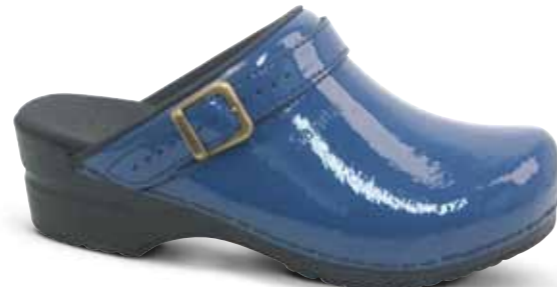
Freya // 457548 // Patent Leather 5 Denim // Size 35-42