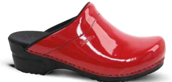
Sonja Patent // 450447 // Patent Leather 4 Red // Size 35-43