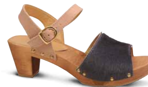
Camilla Flex // 470867 Cow fur and wax leather // 56 Grey // Size 35-42

Genuine cow leather; without removal of natural hairs covering the surface.