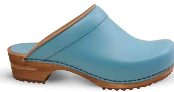
Lotte // 470009W // PU Leather 19 Teal // Size 35-42