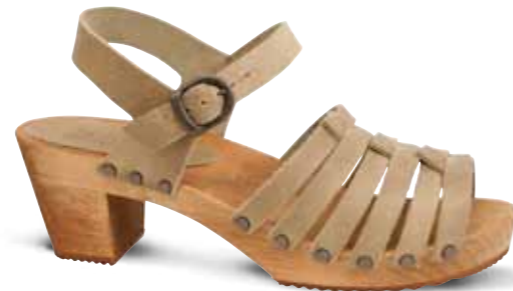
Silo // 476204 Oil Leather // 14 Nature // Size 35-42