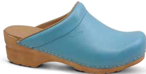
Sandra // 473047 // PU Leather 19 Teal // Size 35-42